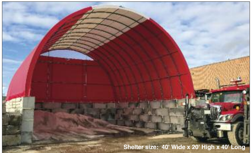
Shelter size: 40' Wide x 20' High x 40' Long