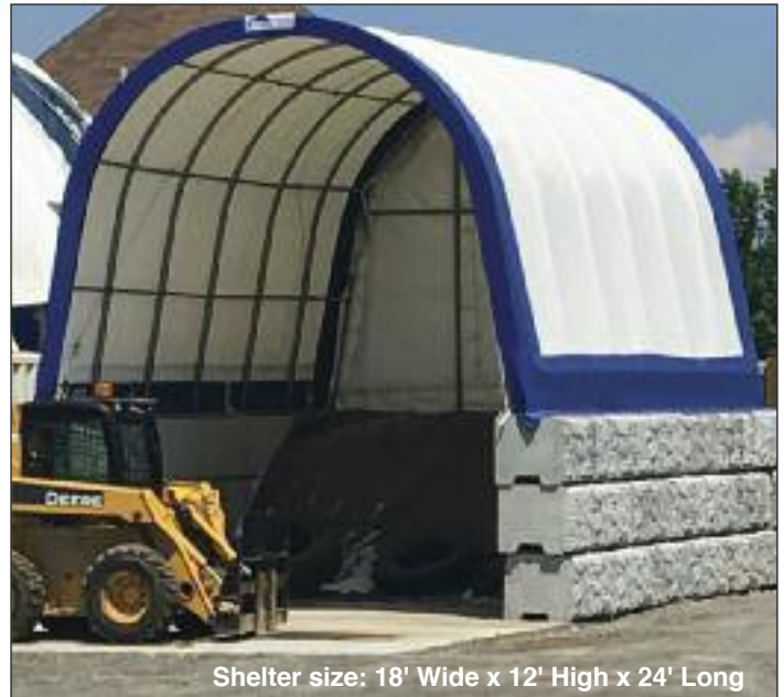
Shelter size: 18' Wide x 12' High x 24' Long

Each of our shelters is manufactured using top quality components in our Toronto plant.